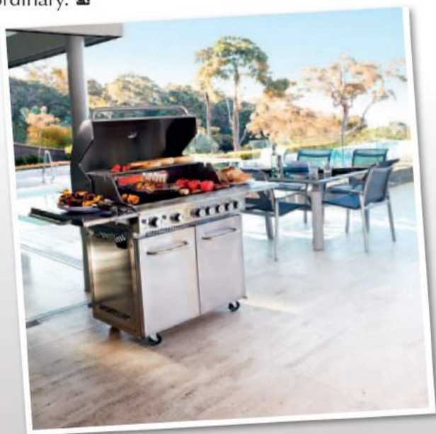
Lift Lifestyle International Limited Unit B, 2/F Cheung Hing Industrial Building 12P Smithfield, Kennedy Town www.liftlifestyle.com | 3907 0386